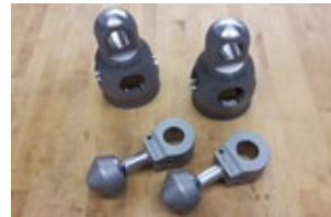
Hybrid solutions for Marine applications (Metal AM & CNC Machining)