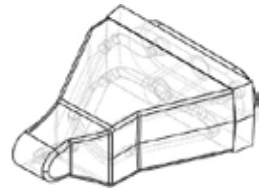
Rendered Conformal cooling passages