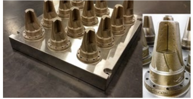
Conformal cooling parts

AM is now being explored for unlocking its potential benefits in the Industrial sector, using Conformal cooling application, hybrid solutions for tooling and fixturing using both AM and CNC manufacturing on the same project. Applications can also range developing fixturing with in the AM builds to help with the post process machining.